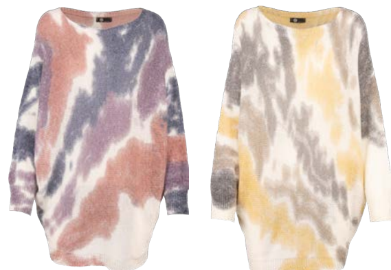
PEPE ROSA COMBO

30%POLYAMIDE 30%POLYESTER 20%MOHAIR 20%WOOL